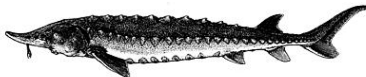
Figure 1: Atlantic Sturgeon, Acipenser oxyrinchus oxyrinchus