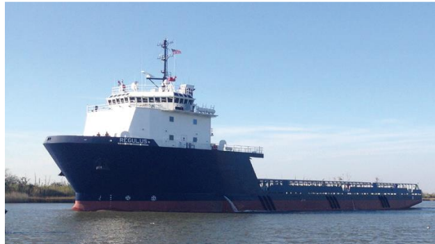
PSV Regulus – 272 ft LOA; Call Sign: WDG8927; MMSI: 366987000