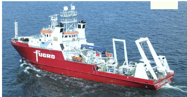
R/V Fugro Brasilis – 219 ft LOA; Call Sign: C6AP7; MMSI: 311000115

US Wind’s geophysical survey vessel, the R/V Fugro Brasilis , has been conducting geophysical survey work in the Lease area since January 8, 2022. On February 7, 2022, after confirming that local fishermen were not actively fishing in the Lease area and providing a seven-day notification window, the R/V Fugro Brasilis began survey work in All Zones (A-D) (see chartlet below). Local scout vessels and observers onboard the survey vessel, including the Offshore Fisheries Liaison, have maintained a sharp lookout for fishing gear to ensure avoidance. Some lost gear has been identified and returned it to its owners. US Wind’s fisheries liaisons continue to share information and coordinate activities with local fishermen.