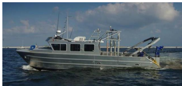
R/V Westerly – 50 ft LOA; Call Sign: WDF7918

On March 28, 2022 the R/V Westerly will be conducting geophysical survey operations in the near shore Atlantic Ocean in Zone D . The Westerly will be accompanied by the vessel Ocean City Girl , which will carry Protected Species Observers to support survey operations.